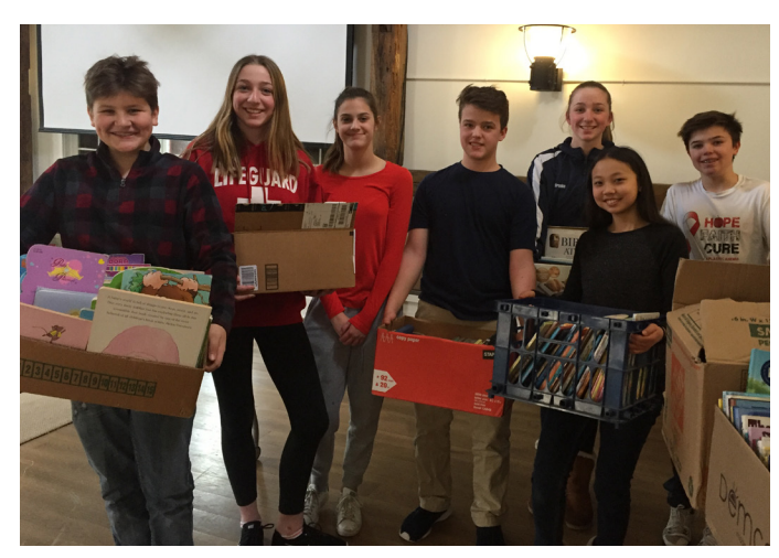
Sherman Student Volunteers