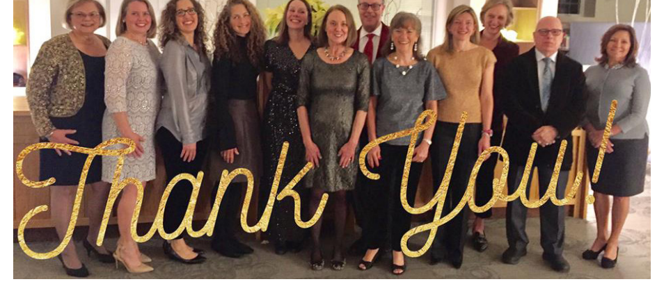
Sherman Library Board of Trustees

The Sherman Library Association is most grateful for the generosity of our many supporters. Although we function as a public library for the Town of Sherman we are a not-for-profit library. This means that our annual appropriation from the town provides a portion of our operating budget. The remaining funds come from other sources, principally from our annual membership campaign, fundraising events, grants and other donations.